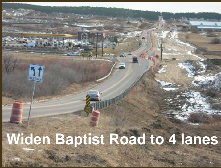
Widen Baptist Road to 4 lanes