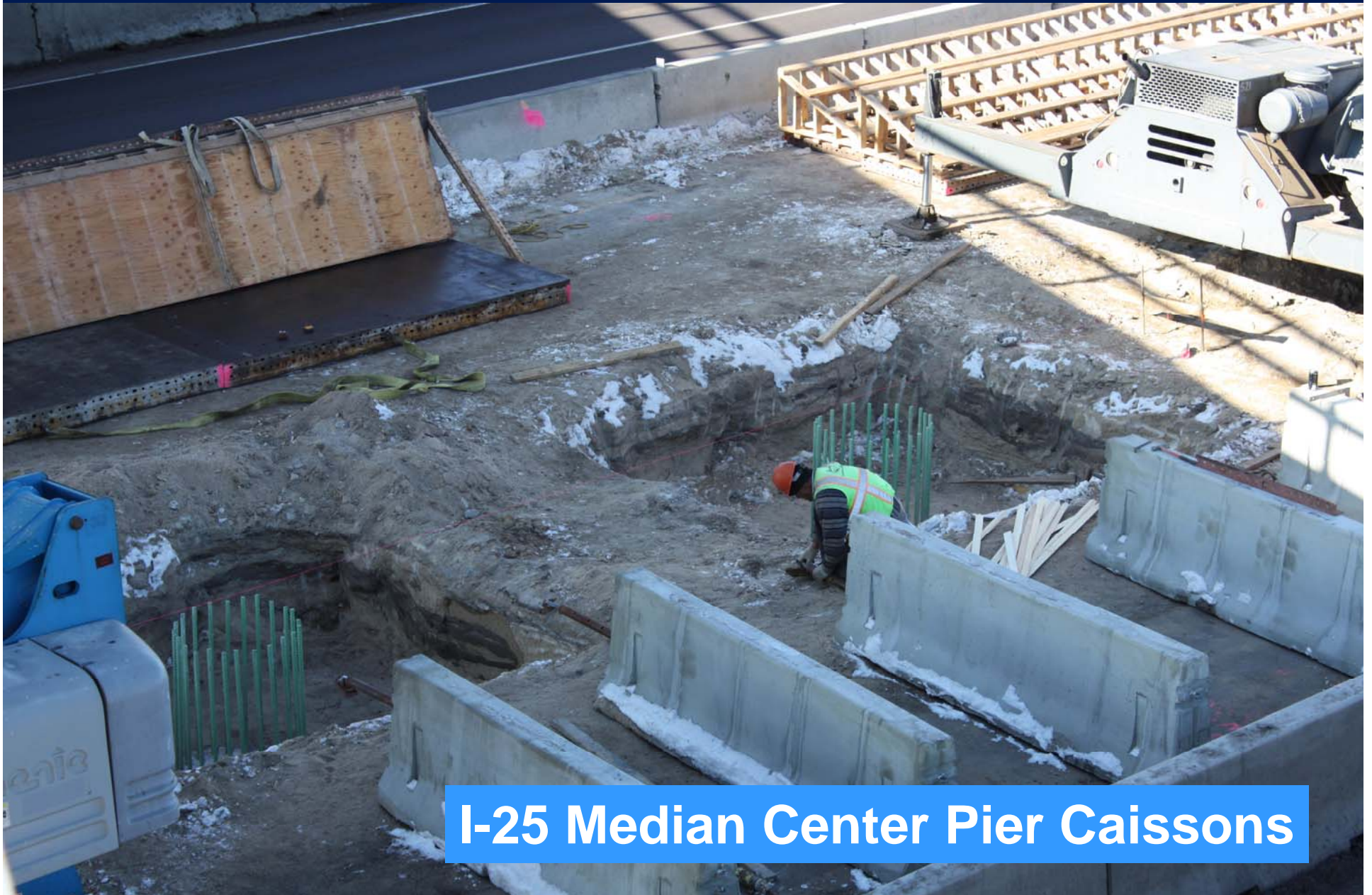
I-25 Median Center Pier Caissons