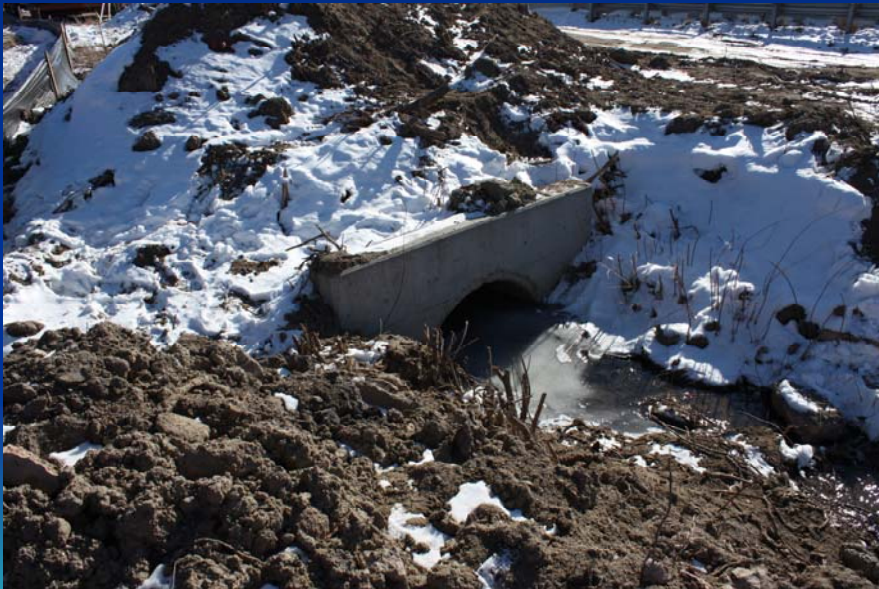
Storm Sewer and Water Quality Ponds