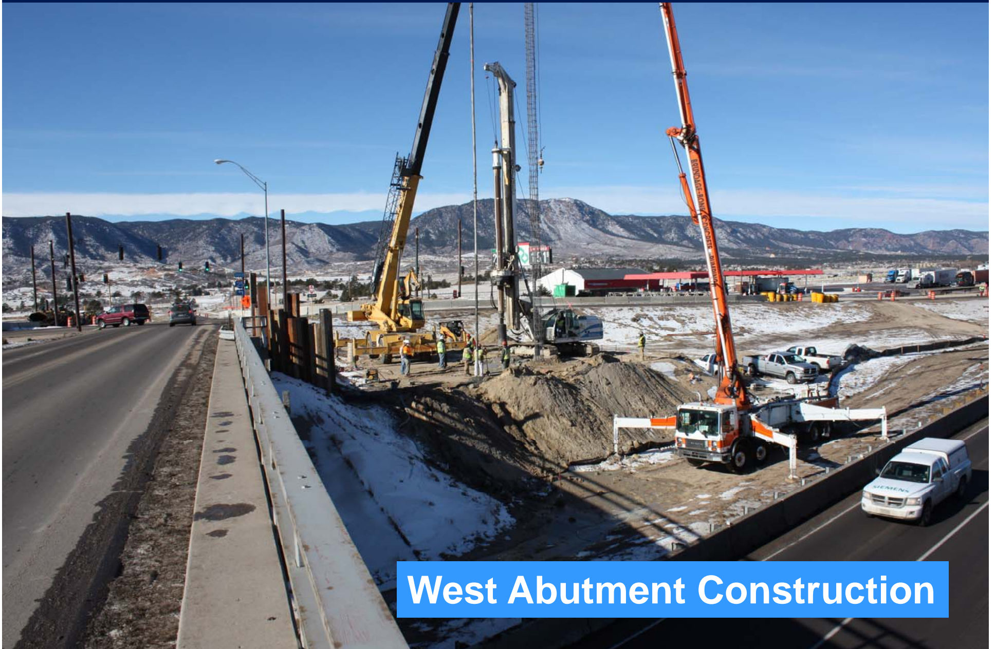
West Abutment Construction