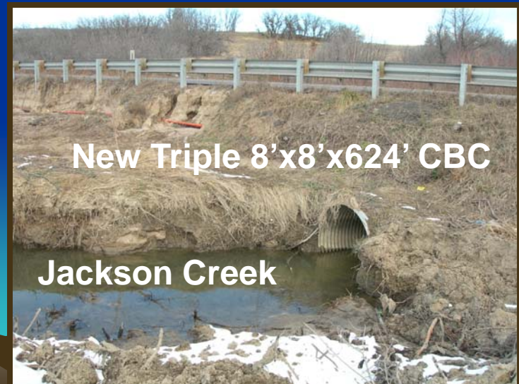
New Triple 8'x8'x624' CBC