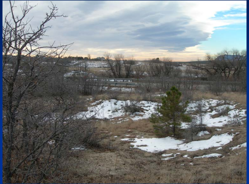
PMJM Habitat and Wetland Mitigation