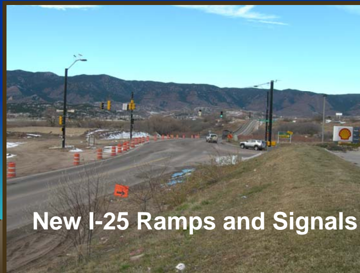
New I-25 Ramps and Signals