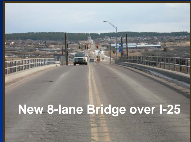
New 8-lane Bridge over I-25